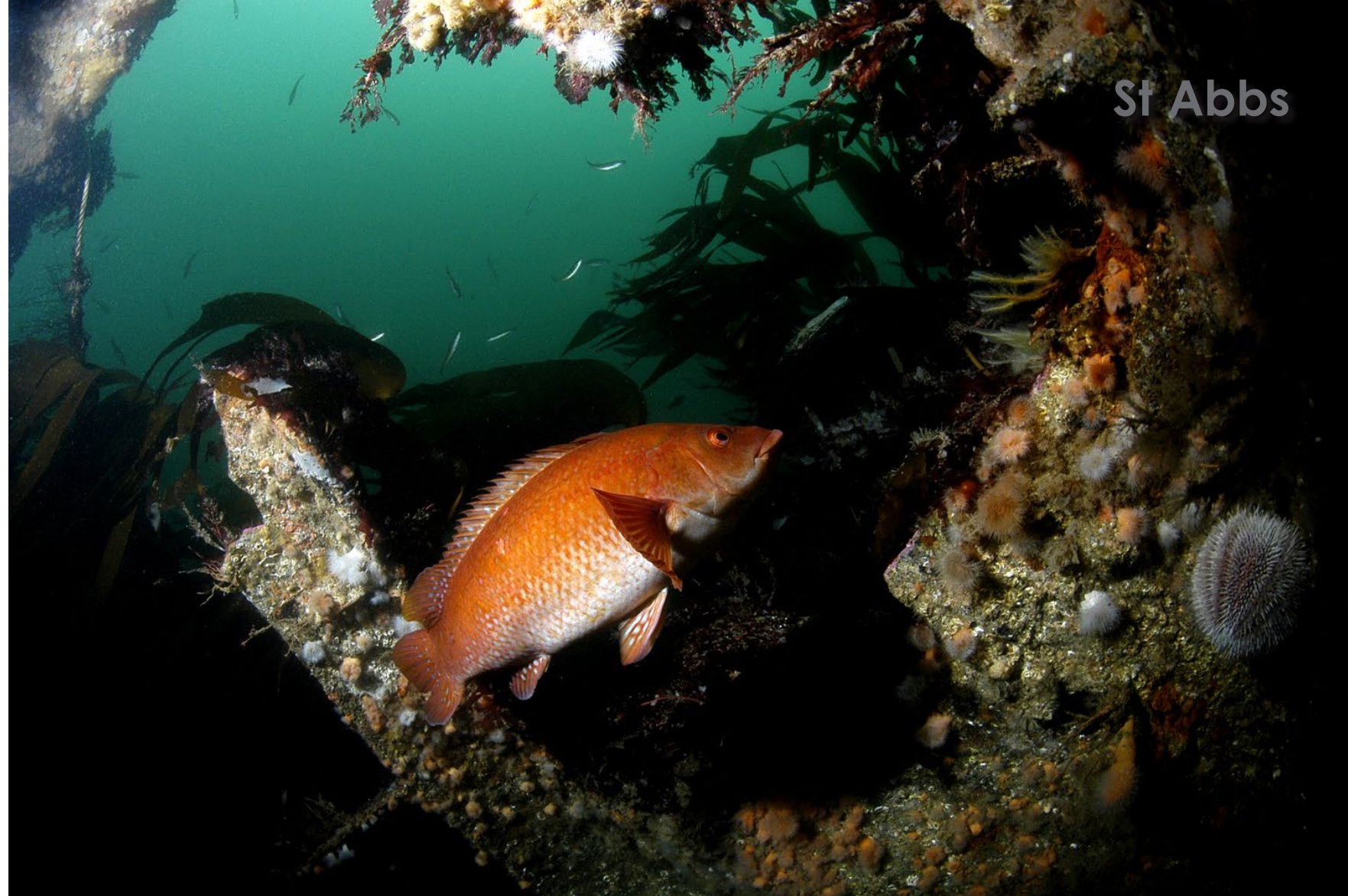
Dahlia anemone (left); School of mackerel (above); Ballan wrasse on North Sea shipwreck (right)