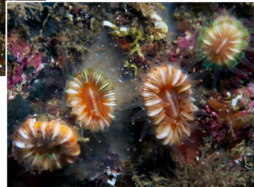
Devonshire cup corals

Fast Castle is 8 km (5 miles) north of St. Abbs Head and is probably as far as dive boats