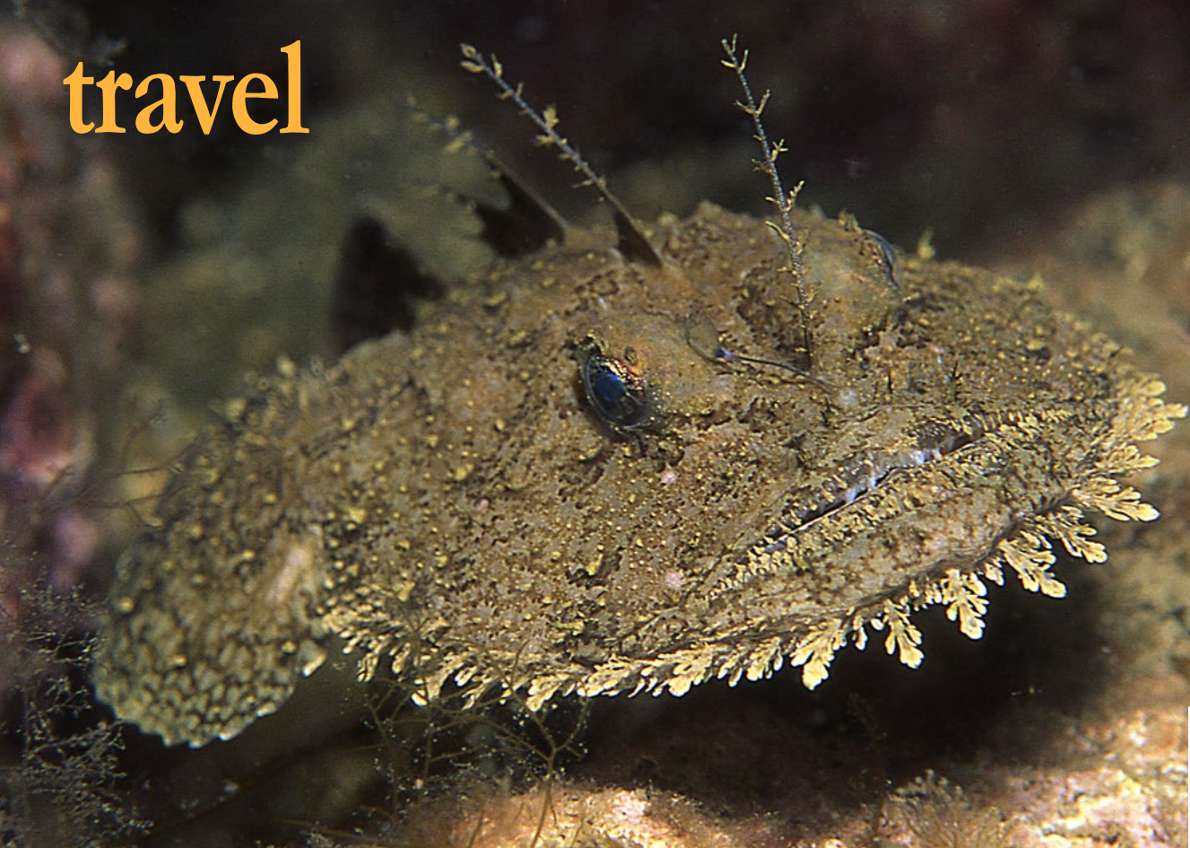
CLOCKWISE FROM LEFT: Anglerfish; Tub gurnard; Velvet swimming crab eating juvenile fish; Snake pipefish

flounders and swimming crabs are common. The sides of the walls are mostly covered in kelp and a few soft corals, sponges and anemones, the bottom metre of the wall is scoured clean by the constant moving of the sand in the channel during prevailing storms. Further out into the current the shelf drops away in 'fingers' similar to a spur and groove reef. Known as the Anemone Gullies, on the tops and sides of the ridges, huge plumose anemones can be found in three colour varieties as well as thousands of brittle starfish. In the val-