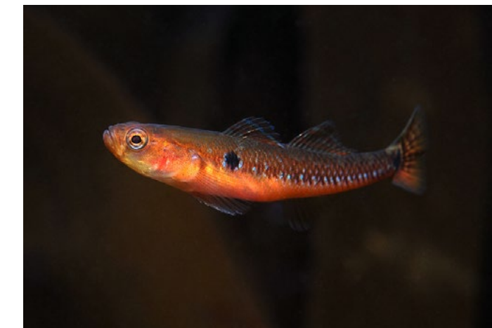
Two spot goby

The prevailing weather pattern is from the north east which may cause northerly swells, fortunately they rarely last any length of time. Water visibility alters drastically along the Scottish east coast and is generated by the prevailing wind only.