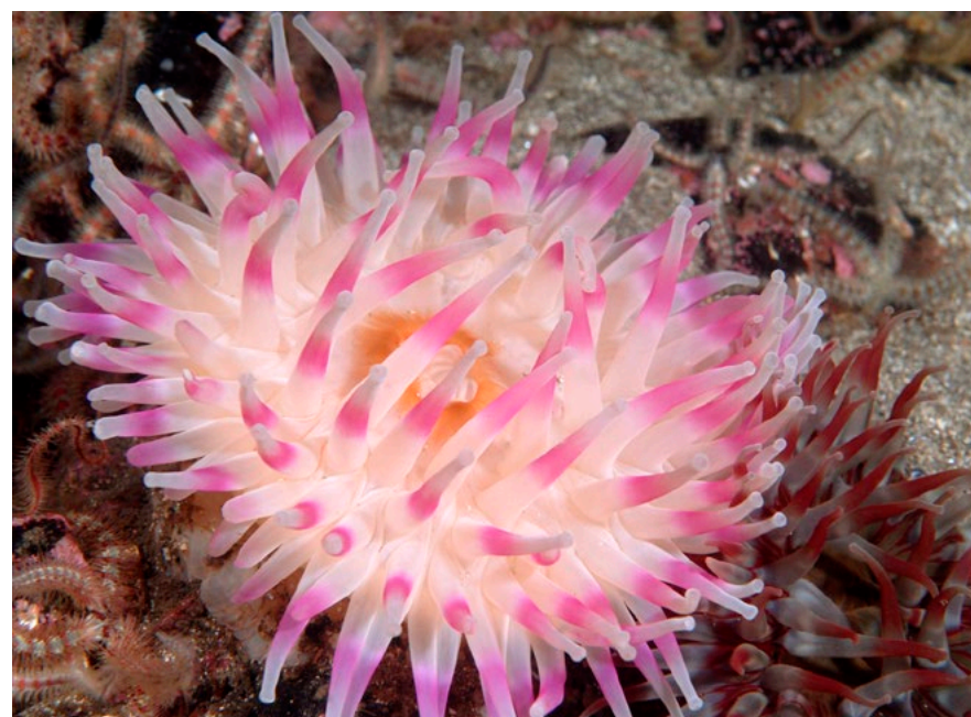
Eyemouth Harbour (left); Dahlia anemone (above) PREVIOUS PAGE: Brittle starfish