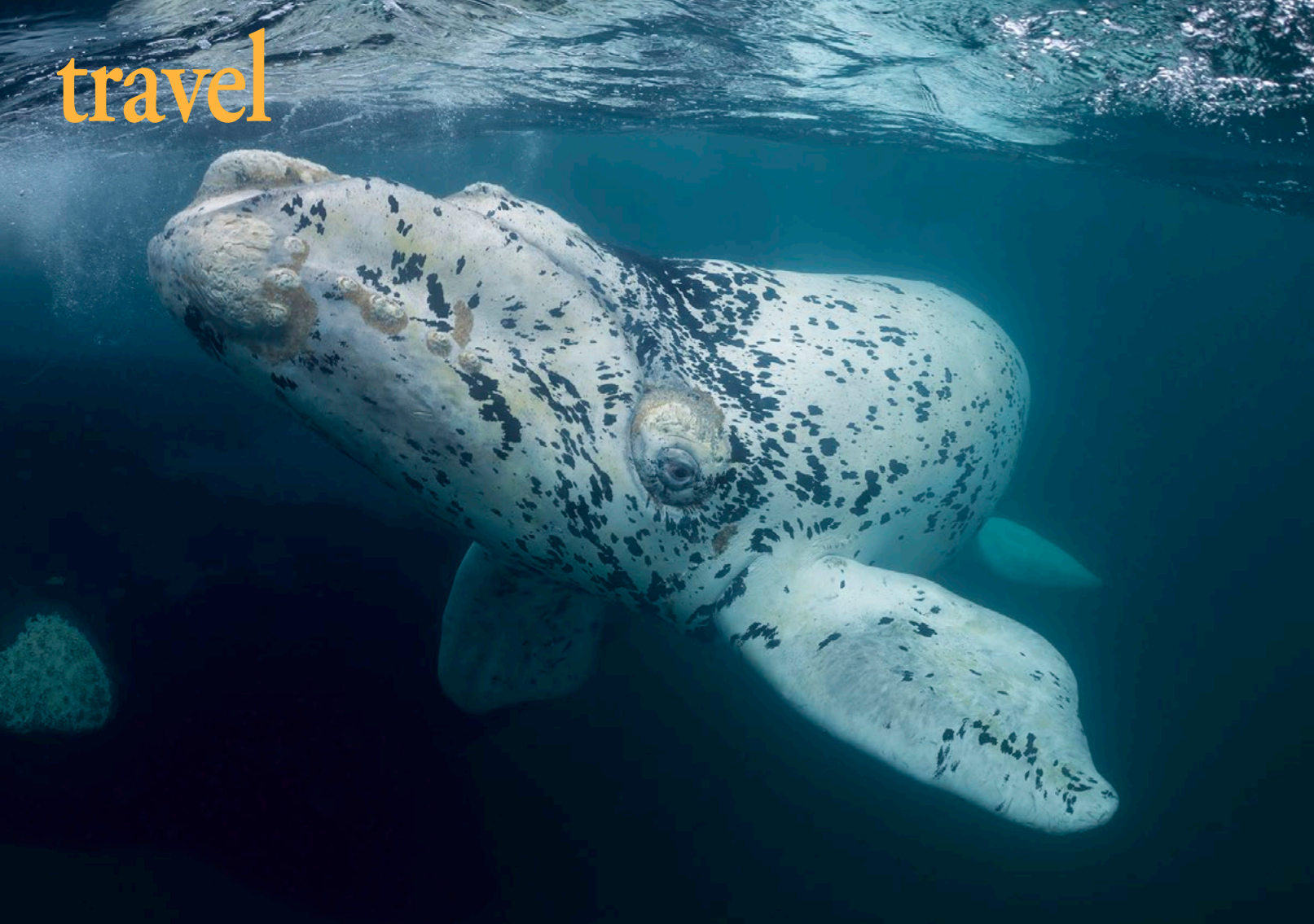
"El Blanco" (The White One), a rare white southern right whale calf

Implementing enlightened conservation practices is often easier said than done, but the practical execution at Peninsula Valdés is truly commendable, with the large numbers of southern right whales serving as its primary allure. Whale watching forms the linchpin of the economy in Puerto Pirámides, the quaint town serving as the peninsula's ecotourism hub. During the season, hundreds of tourists embark daily at Gulf Nuevo to witness the mothers and their calves.