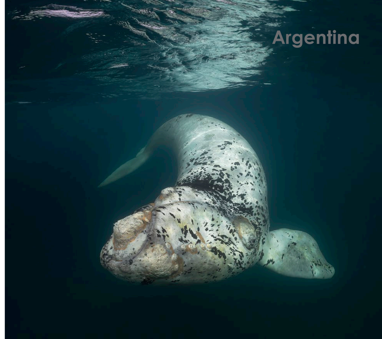
View of Peninsula Valdés in Argentina (above); A rare white southern right whale calf, nicknamed “El Blanco” (top right); Breaching southern right whale at sunset (bottom right); Curious southern right whale calf, with its mother below (previous page)

To be in the water with a southern right whale is a life-changing experience. Don Silcock shares his adventure in Argentina to photograph these majestic marine mammals, where he was lucky enough to see a rare white calf.