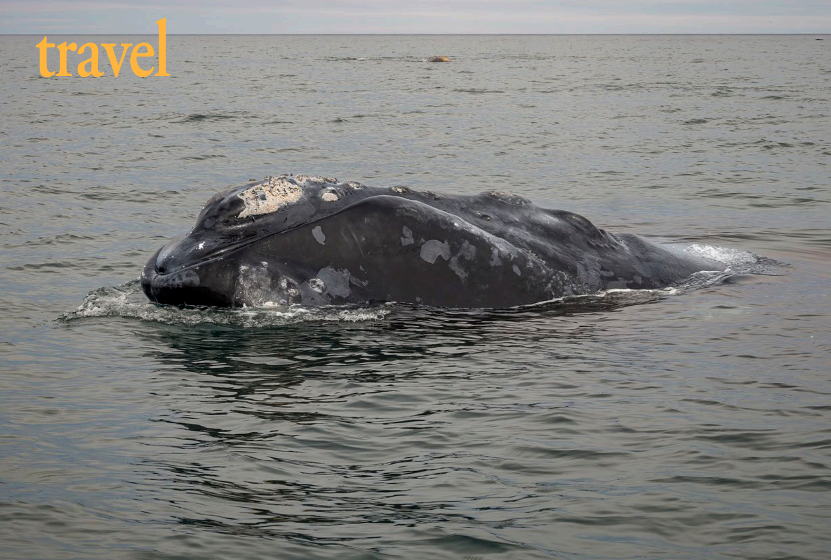
Southern right whale at the surface

the southern right whale. This resurgence has been so significant that they are now classified as “Least Concern” (LC) on the IUCN Red List.