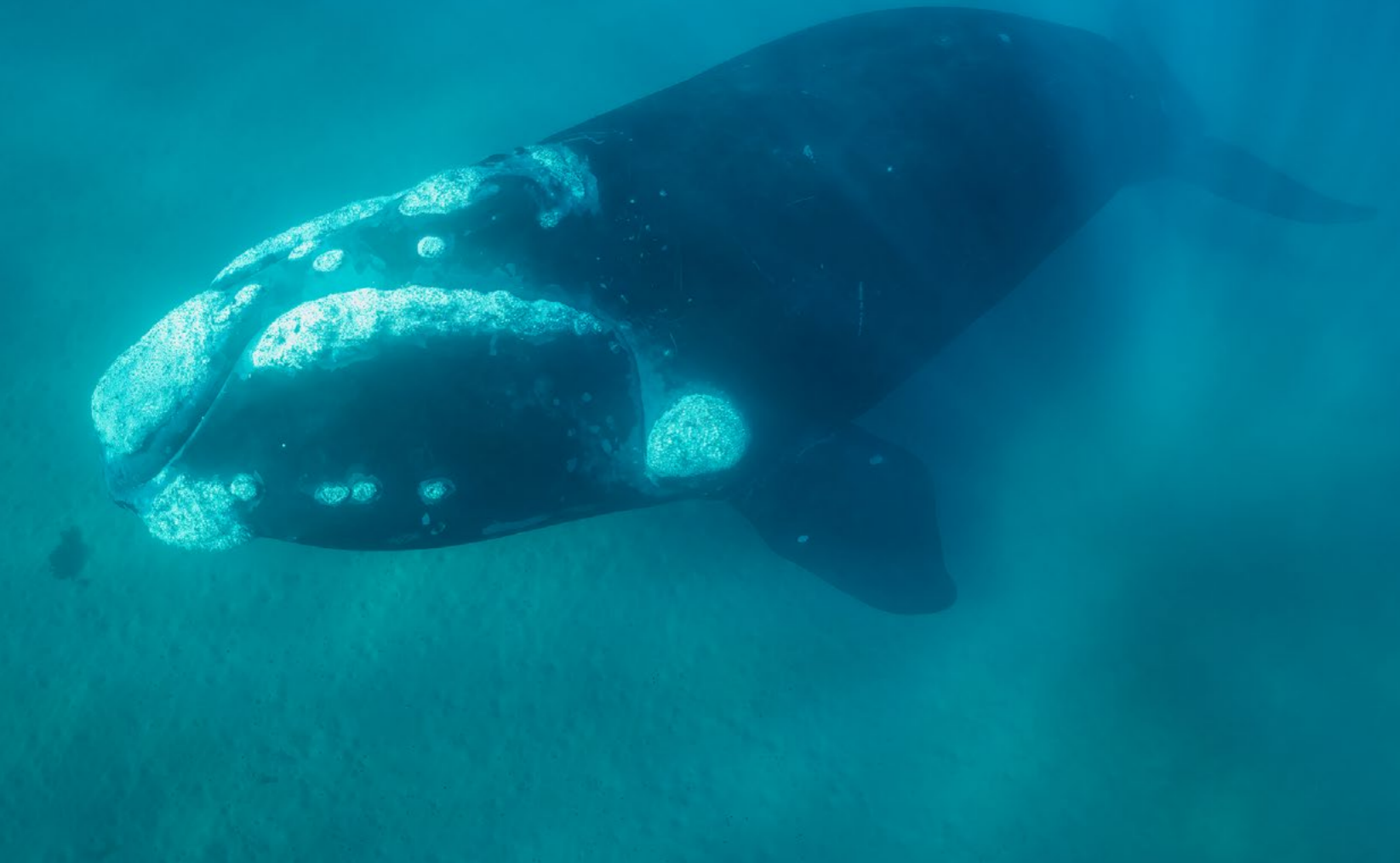
Southern right whale adult (above). Recent estimates of current populations indicate that there are approximately 500 North Pacific right whales, a mere 350 North Atlantic right whales, and a comparatively more optimistic count of 15,000 southern right whales.

long-term prospects appearing bleak unless significant changes occur. However, the southern whales tell a different story—a tale of resilience and remarkable recovery. While there is still work to be done, the signs are undeniably positive.