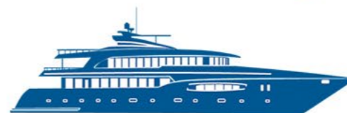
Maldives BLUE FORCE ONE