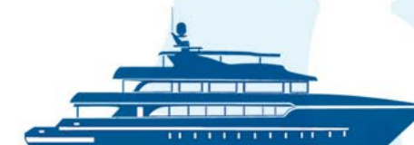
Maldives BLUE FORCE 3