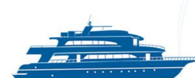
Red Sea BLUE FORCE 2