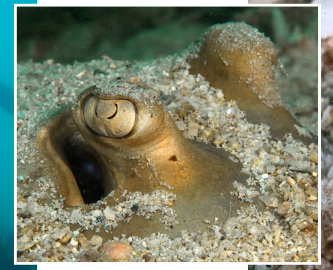
CLOCKWISE FROM LEFT: Batfish at jetty; Eyes of stingray buried in sand; Snake eel; Cowrie; Mantis shrimp