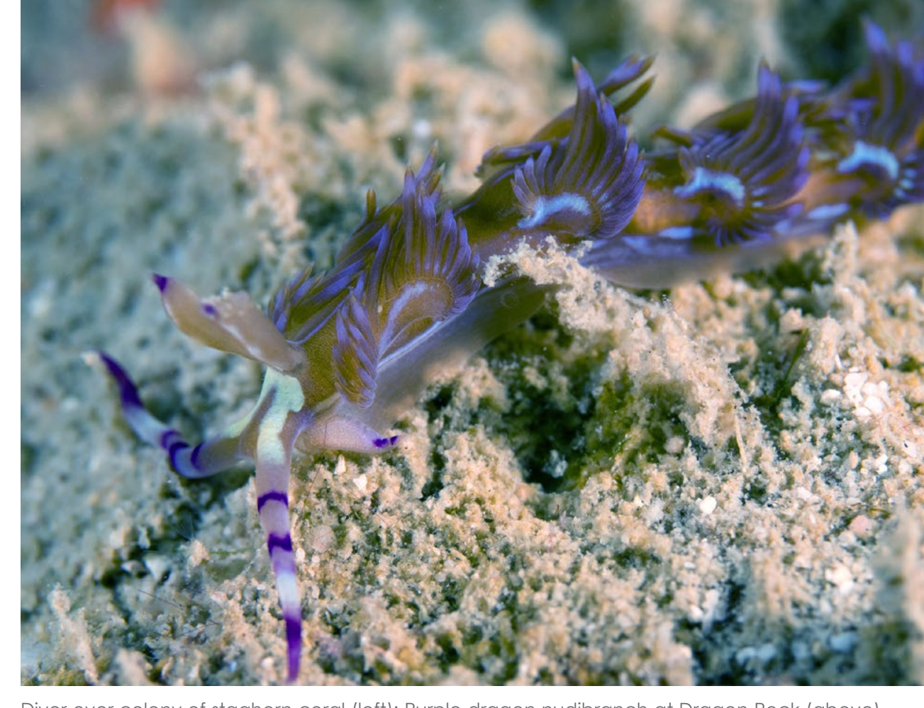
Diver over colony of staghorn coral (left); Purple dragon nudibranch at Dragon Rock (above)