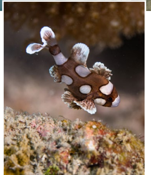
Juvenile harlequin sweetlips (left inset); Hard coral head (right inset)

crocodile fish waiting to ambush their next meal, and the bizarre-looking and poisonous Indian walkman, also known as the demon stinger or devil stinger, which is closely related to stonefish.<sup>1</sup>