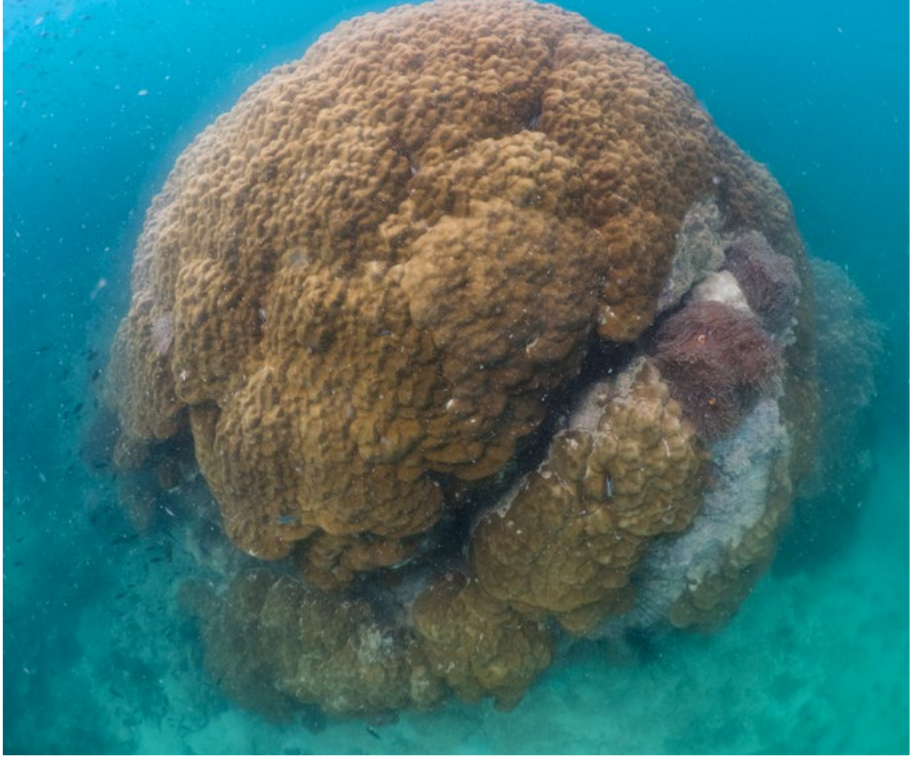
lucky, can be found in the sand just off the reef, as well as mantis shrimp hiding out in small holes on the sea bed. While exploring the sandy areas, keep an eye out for stingrays hiding underneath a thin layer

Pipefish, and sometimes even seahorses if you are