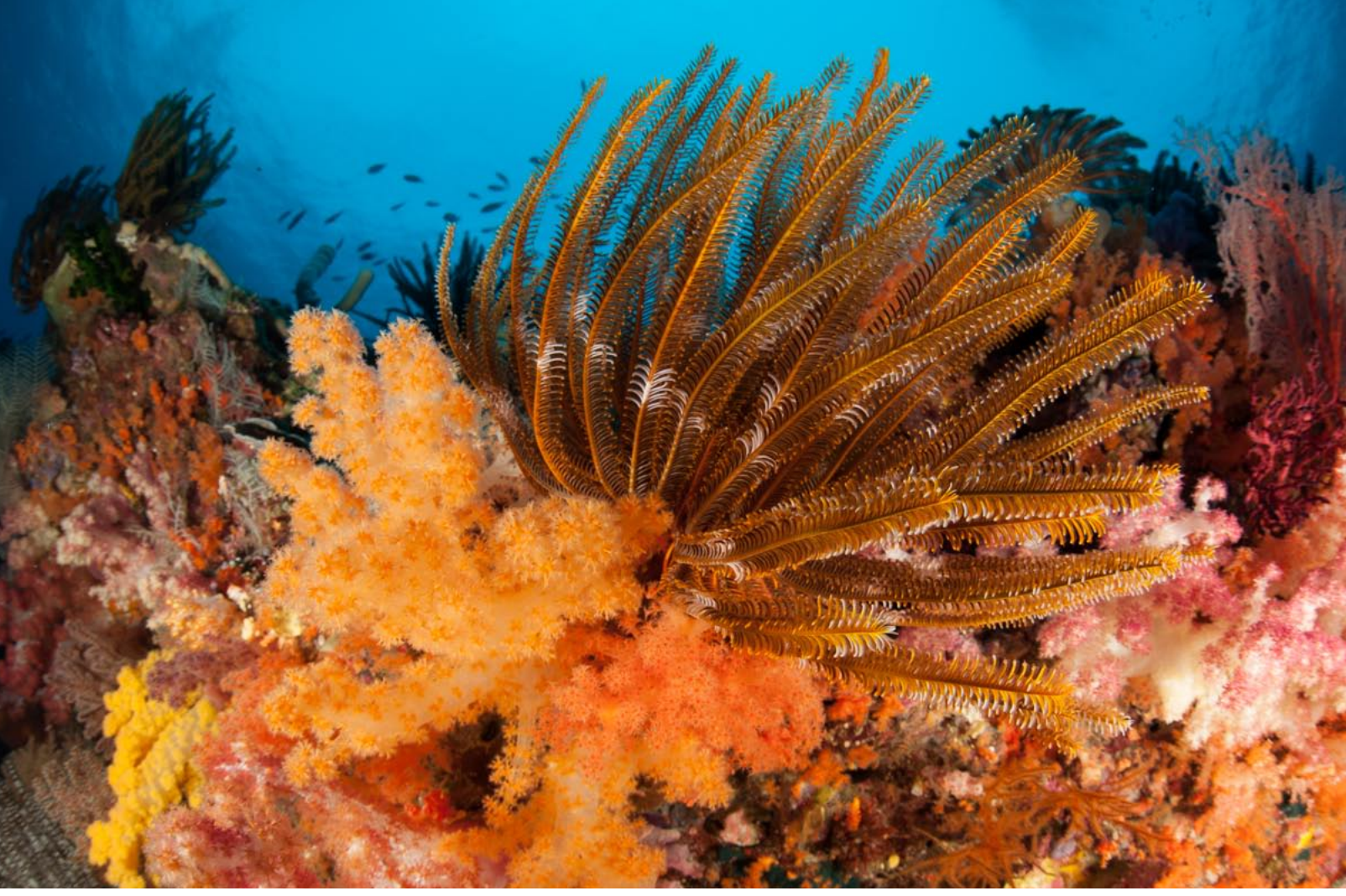
Crinoid and soft coral growth in the Misool Region