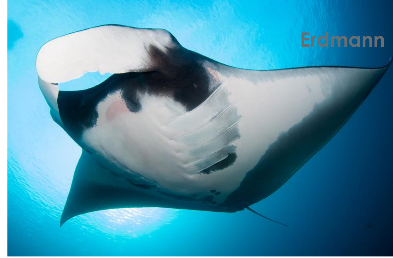
Soft corals at Citrus Ridge, near Waigeo in the north (left); Manta Rays at Blue Magic (above)

Besides serving as a management "classroom" (the lessons learned from which are now being shared around Indonesia), Raja Ampat's position at the top of the "Indonesian Throughflow" of waters from the Pacific towards the Indian Ocean means that having healthy populations of reef fishes and other organisms here can actively "seed" other reefs in eastern Indonesia due to the strong currents passing through Raja Ampat and towards the Maluku spice islands.