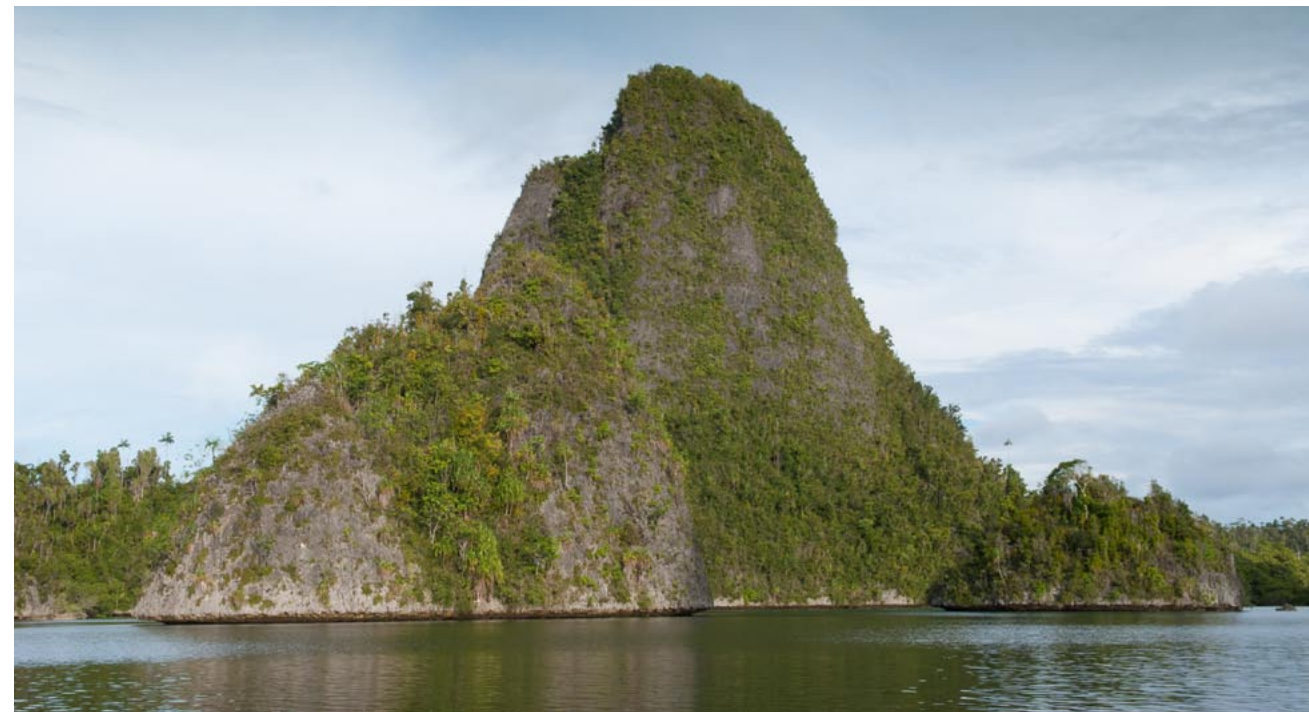
Limestone islands at Wayag

when I was doing my PhD work in the early 90's were actively finning around Raja Ampat even back then. However, Raja Ampat has now implemented the first shark and ray sanctuary in the Coral Triangle (across all of its waters), and the regency law #9/2012 (passed in December 2012 and announced in February 2013) provides serious legal sanctions (and NO LOOPHOLES!) for