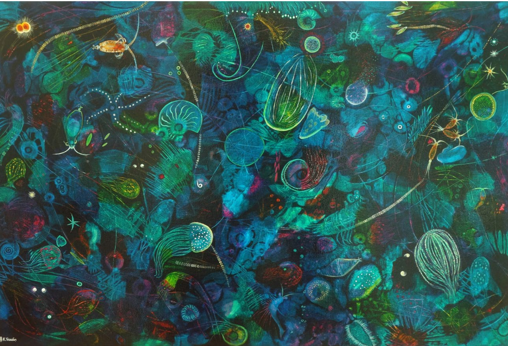
Plankton , by Kim Vaudin, acrylic on canvas, 24 x 36 inches

X-RAY MAG: What are your upcoming projects, art courses or events?