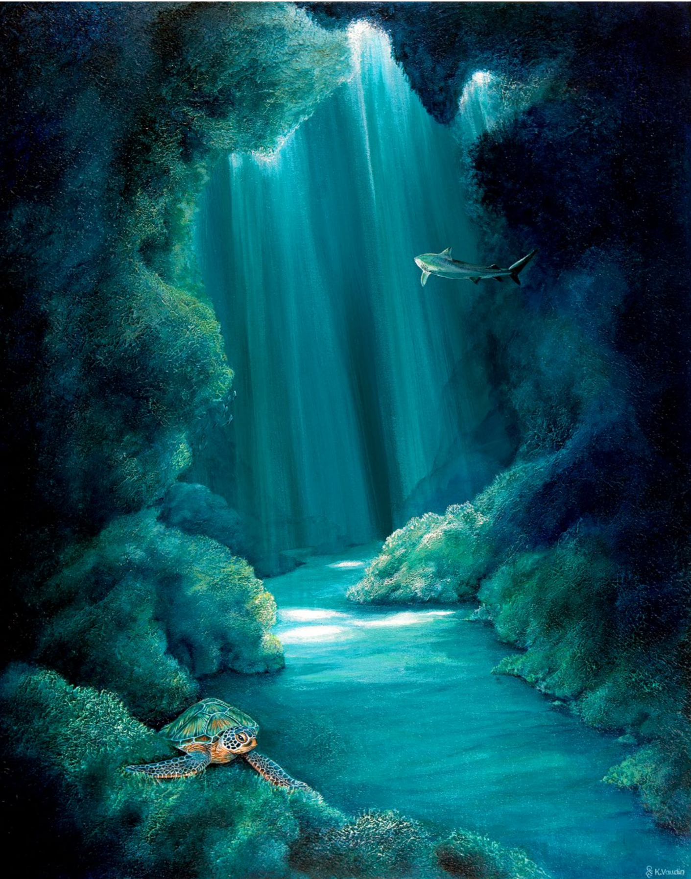
Cavern by Kay Vaudin, acrylic on canvas, 30 x 24 inches