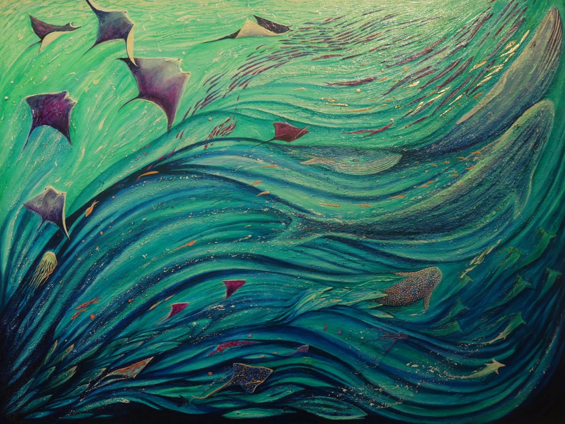
The Wave , by Kim Vaudin, mixed media on canvas, 30 x 40 inches (left); Undersea Sunswirl , by Kim Vaudin, acrylic on canvas, 30 x 30 inches (right); Manta Light , by Kim Vaudin, acrylic on canvas, 36 x 24 inches (below)