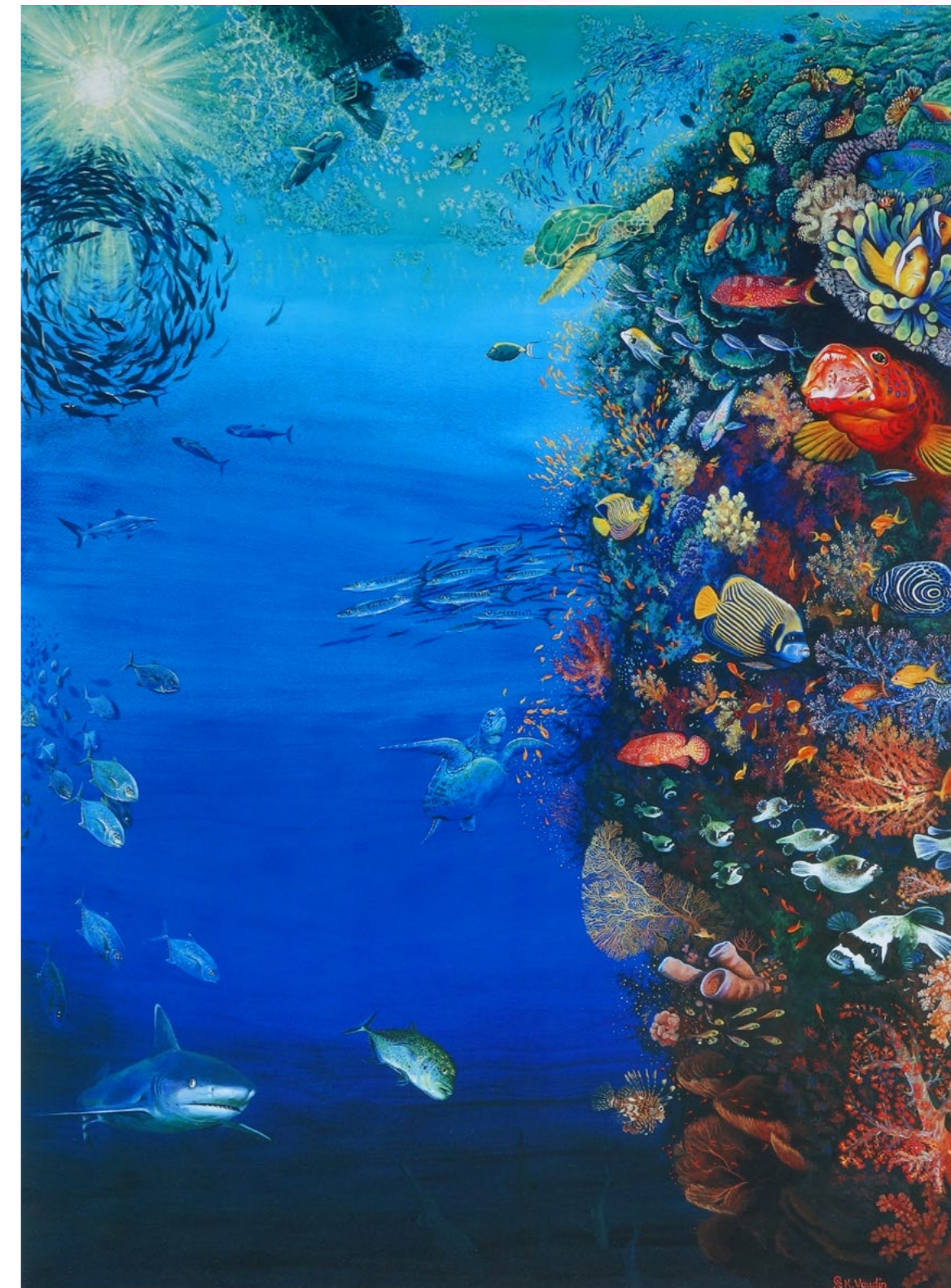
The Wall , by Kim Vaudin, acrylic on paper, 23 x 17 inches

Our new work on canvas is far more organic. We never know how they will come out and it is very freeing and exciting. We use a lot of different texture effects, adding tissue paper, fabric and mixing in sand, which