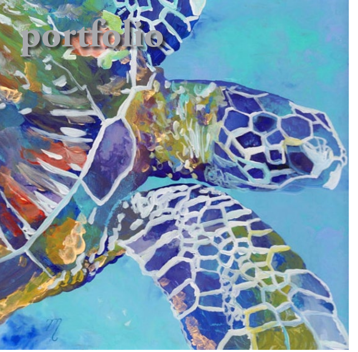
CLOCKWISE FROM ABOVE:: Honu, Honu 4, Honu 2, Honu 6, Honu 3, by Marionette Taboniar. Reverse acrylics on plexiglass, 12 x12 inches. Honu means sea turtle in the Hawaiian language

fish riding inside the wave itself. In the winter months, the enormous humpback whales come to mate and give birth in the warm waters of Hawaii. I never tire of seeing these amazing creatures jump out of the water as they breach. I can sit and watch them for hours.