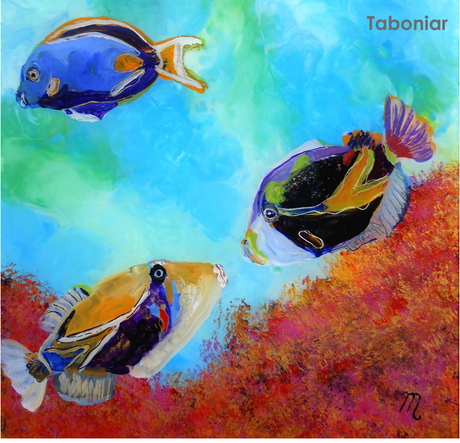
Hawaiian Tropical Fish 4, by Marionette Taboniar. Reverse acrylics on plexiglass, 12 x12 inches

painting method called reverse acrylic painting on plexiglass. It's exactly what it sounds like. I paint with acrylics on the back of a piece of plexiglass. Because I'm painting on the back surface, the details have to be painted first, then you work towards the background. That's why it's called "reverse" painting. It sounds very challenging, but it's