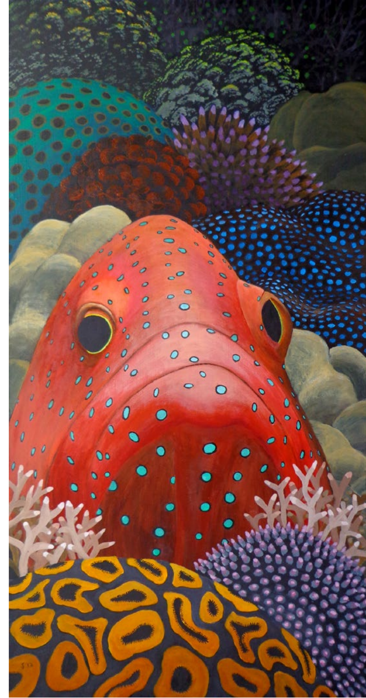
Always Curious (2013) by Jay Maclean Acrylic on plywood 48 x 24 inches

All Puffed Up (1999) by Jay Maclean Oil on canvas 60 x 60 inches