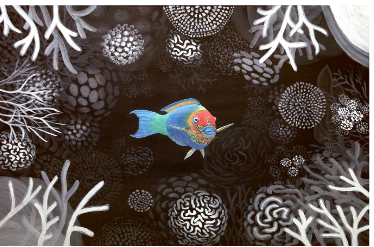
Out Late Definitive (2013) by Jay Maclean. Acrylic on canvas, 36 x 24in. Of the work, the artist said: "More radical is this near monochrome work. Bleached corals? Nighttime scene? You decide."

JM: As I implied earlier, marine conservation became a "passion" early on and still holds me. The main message is that we do not want to lose these fragile