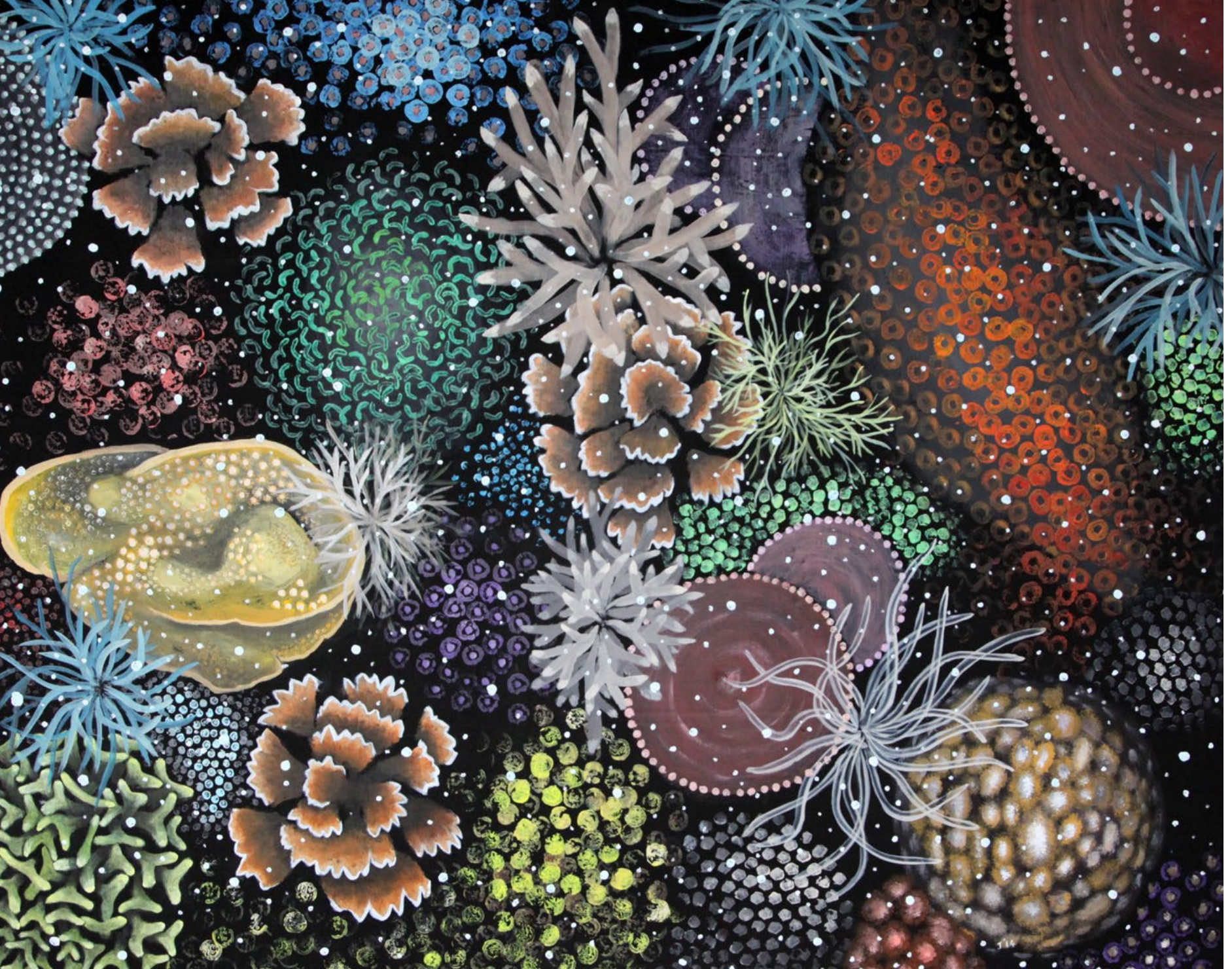
X-RAY MAG: What is your artistic method or creative process?

JM: Images and music crowd in on me when I snorkel (I have stopped diving now, which is not a handicap since the nearby reefs are fringing and extend down only 10m). I have periods when underwater photographs help but mainly only as reminders.