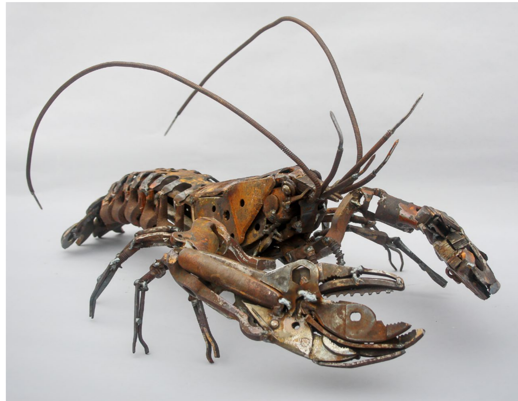
Mole Grip Lobster , by Harriet Mead. Welded collage of found metal objects, 55cm long