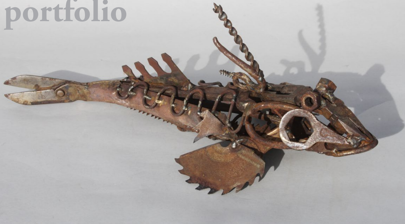
Tin Snip Dragonet , by Harriet Mead. Welded collage of found metal objects, 16.5 x 48 x 17.5cm

whilst allowing people to make a living from it.