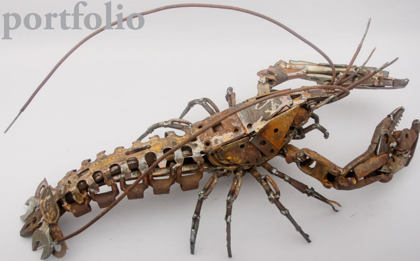
Top view of Mole Grip Lobster , by Harriet Mead