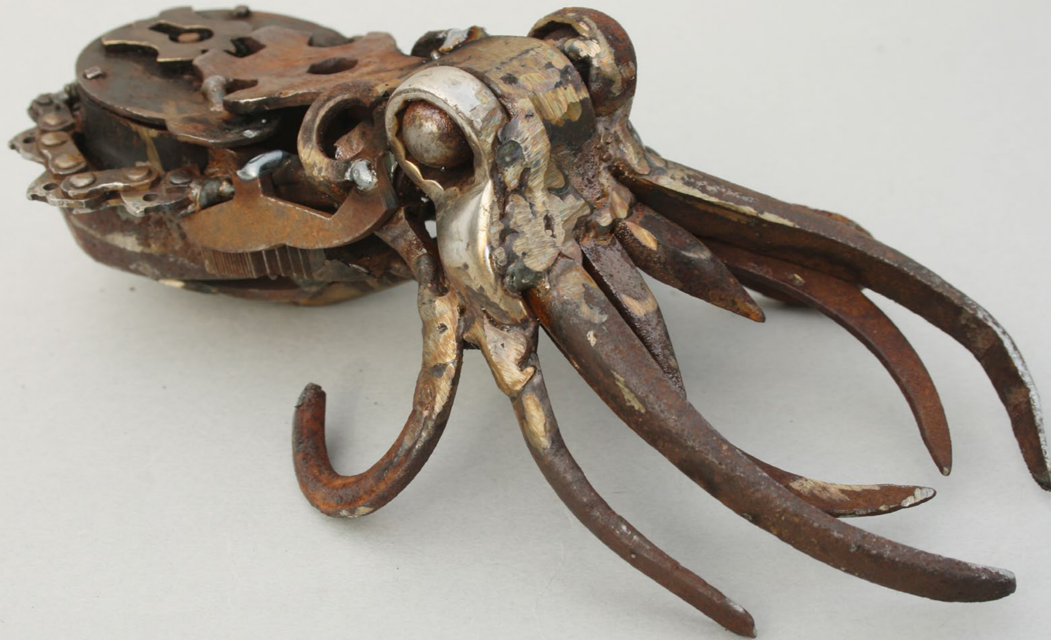
Padlock Cuttlefish , by Harriet Mead. Welded collage of found metal objects, 6.5 x 18 x 9cm