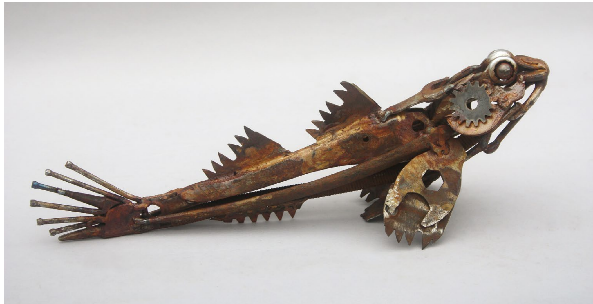
Sawblade Goby , by Harriet Mead. Welded collage of found metal objects, 10 x 29 x 9cm

We are told of the threats and issues, but as the ocean is not owned by anyone, it is very difficult to set a cohesive conservation plan in place