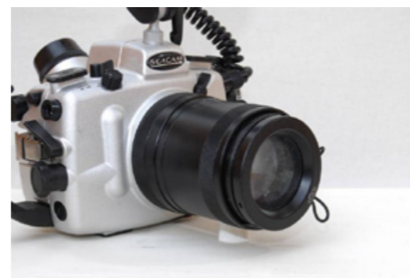
Wetdiopter on a Seacam housing

To some extent, the short distance to the object will compensate for this as will using a 100ASA setting. It is possible to use a strobe with a guide number of only 11 with a 50 or 60mm lens. However, with