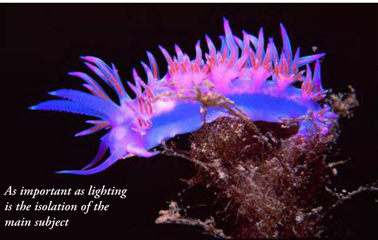
As important as lighting is the isolation of the main subject