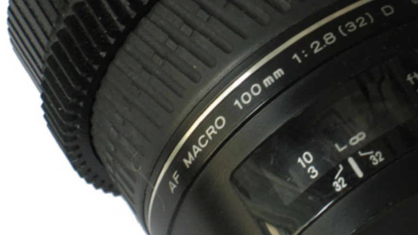
Photo & Videography

Sponsored by H2O PHOTOPROS UNDERWATER PHOTO & VIDEO